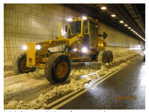
Figure 3. Winter maintenance in the Ville-Marie tunnel

(b) Snow and ice removal inside a tunnel