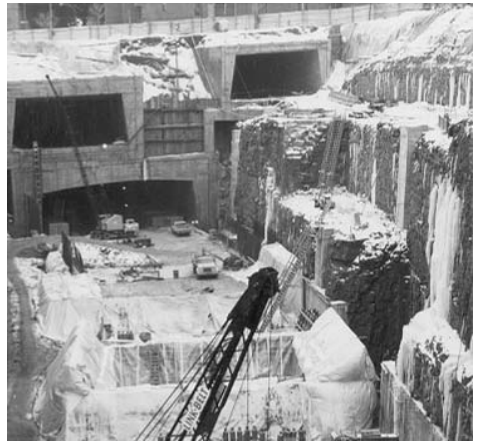
(b) Trench at the Ville-Marie Tunnel