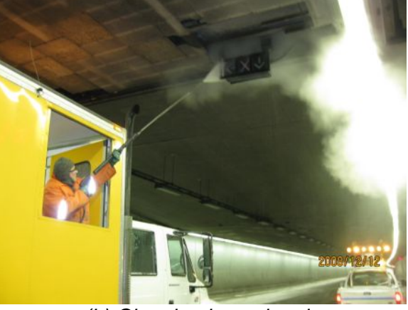
(a) Cleaning the signage