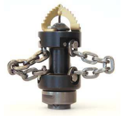
(a) Reaming Nozzle with Chain Head

As the tunnels have aged, annual maintenance using pressurized water trucks (up to 20,000 kPa of pressure) was no longer sufficient to clear these deposits and keep the drainage system working. The magnitude of the obstructions suggested that, if a method were found to restore the design hydraulic pressure in the tunnel, much of the leakage would be adsorbed, and the formation of icicles would be eliminated. A non-structural reaming process was used to rehabilitate the drains in the Ville-Marie tunnel following tests on a few drains that yielded conclusive results (Figure 7).