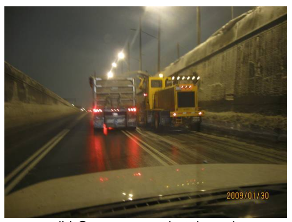
(b) Snow removal at the exit