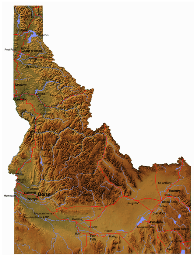
Figure 1 – Idaho Terrain

Idaho has a very diverse geography, ranging from high desert to mountainous terrain as illustrated in Figure 1 below. The Idaho Transportation Department has, over the years, developed a progressive winter maintenance program which involves investment in a number of areas such as labor, training, equipment and materials. Typical treatment materials include salt, salt brine, magnesium chloride and anti-skid. These materials are applied by a winter maintenance operations fleet of 500 plus vehicles to maintain highways in order to promote safe travel and winter mobility.